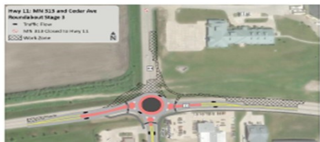
Stage 3: Construct north leg of the roundabout. Hwy 313 will be closed during this stage, approximately 2-3 weeks. See detour map.