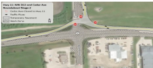
Stage 2: Construct east, west and south legs of the roundabout. Cedar Avenue will be closed during this stage, approximately 3-4 months.

The roundabout construction began in 2024 with the construction of the bypass lane in Stage 1. Stages 2 and 3 will take place from late-May to early-October, 2025.